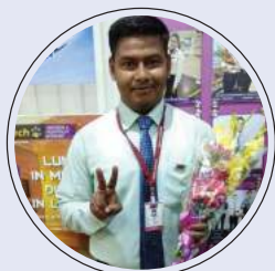
Biswajit Pal Airport Cashier Mumbai