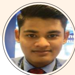
Pratham Baidh Centrum Bagdogra Airport