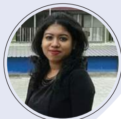
Pampa Chaudhury Airport Cashier Mumbai