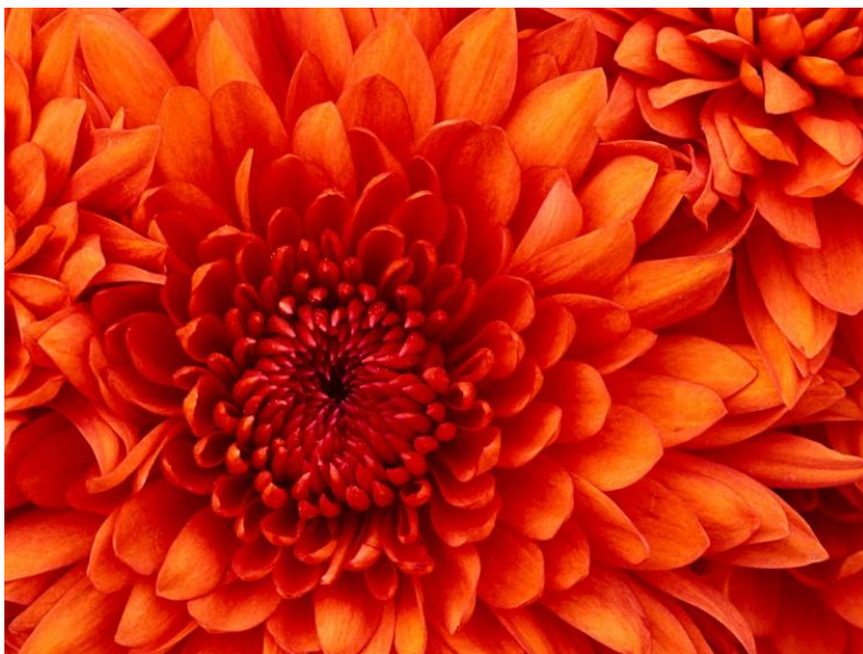
Figure 2: Sample picture